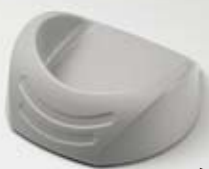
> AS-8000 holder