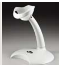
> AS-8000 stand