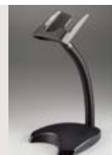
> AS-8120 stand